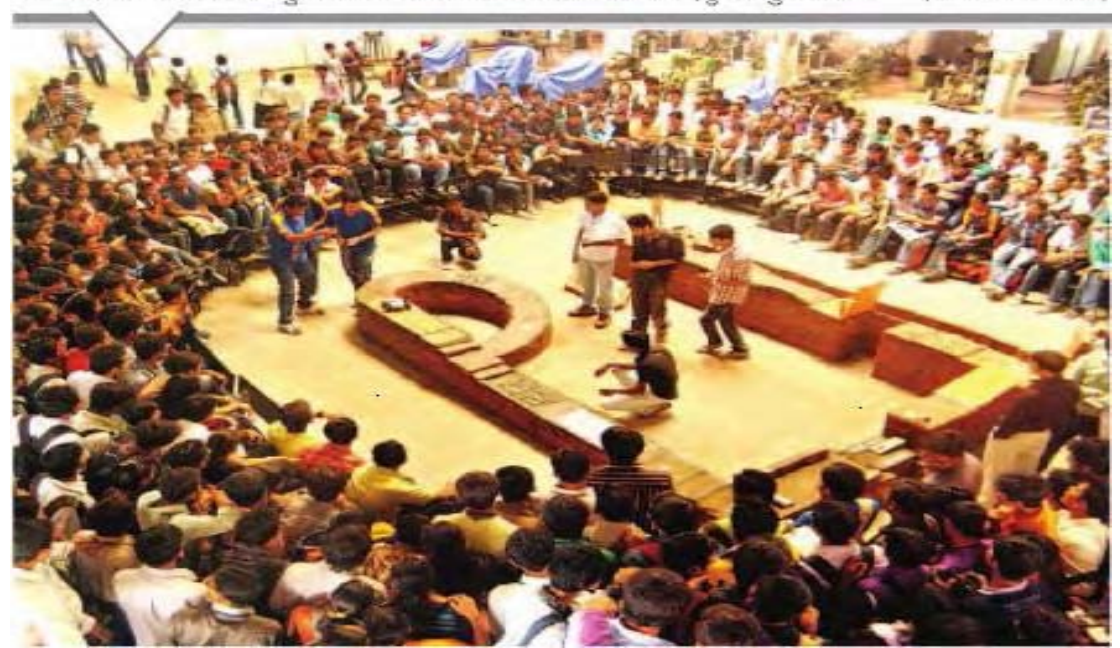
19<sup>th</sup> February, 2011 Gujarat Samachar

પારૂલ ઇન્સ્ટિટ્યૂટના વાર્ષિક ટેકનિકલ મહોત્સવ પ્રેજેક્શન-૨૦૧૧નો પ્રારંભ કરાયો હતો, જેમાં પ્રિન્ટોફિલા, મોટો ક્યુરિયસ, કૃતિ કૌશલ, કુરૂક્ષેત્ર, ડી જે.લોર જેવા વિવિધ ટેકનિકલ અને ગોન ટેકનિકલ ઇવેન્ટો ચોજાયા હતા.જેમાં ગુજરાત, તમીલનાડુ, મહારાષ્ટ્ર, રાજસ્થાન અને ઇન્દ્રોર રહિત ૨૦૦૦ થી વધુ વિદ્યાર્થીઓએ માગ લીધો હતો તસવીરમાં મોટો ફ્યુરિયરનું એક દ્રશ્ય.